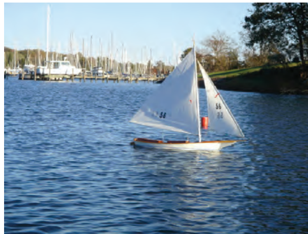
OR ENJOY A RELAXING SAIL