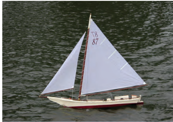
WITH THE RESULTS OF A MASTERPIECE