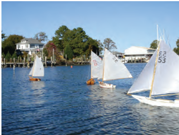
ENJOY A FUN RACE