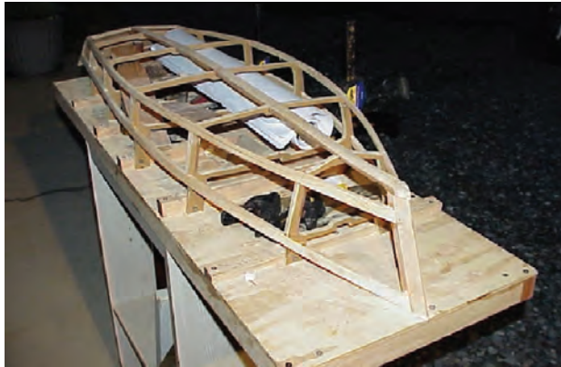
THE START OF AN ENJOYABLE ADVENTURE

We have the plans, the materials, and the workshop to help you build your skipjack. Your love of the sea, the Chesapeake Bay region, and its history will be amplified with your SIMBC membership.