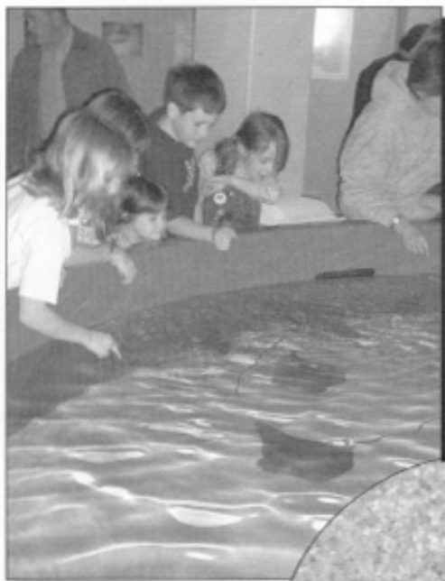
Visitors to the opening of the exhibit on October 23, 2004, enjoyed the live specimens in the large tank that is the central attraction.

parts of water. Again, they are highly advanced, and not at all primitive, as previously thought.