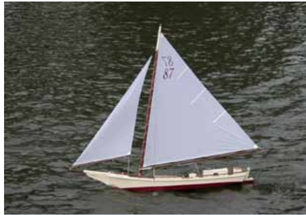
WITH THE RESULTS OF A MASTERPIECE