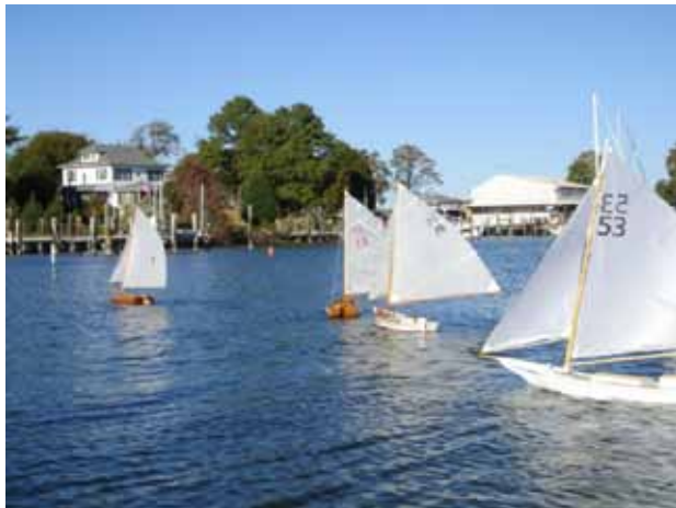
ENJOY A FUN RACE