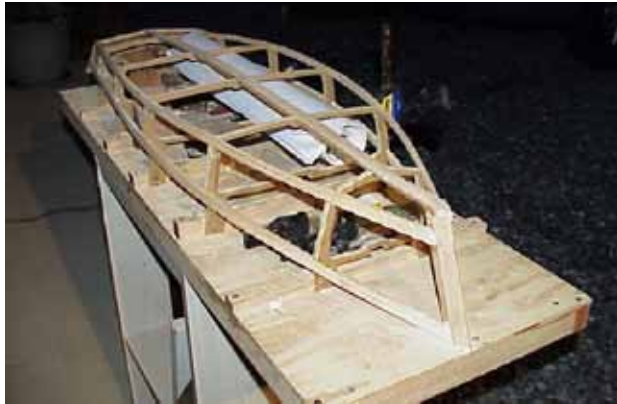
THE START OF AN ENJOYABLE ADVENTURE

We have the plans, the materials, and the workshop to help you build your skipjack. Your love of the sea, the Chesapeake Bay region, and its history will be amplified with your SIMBC membership.