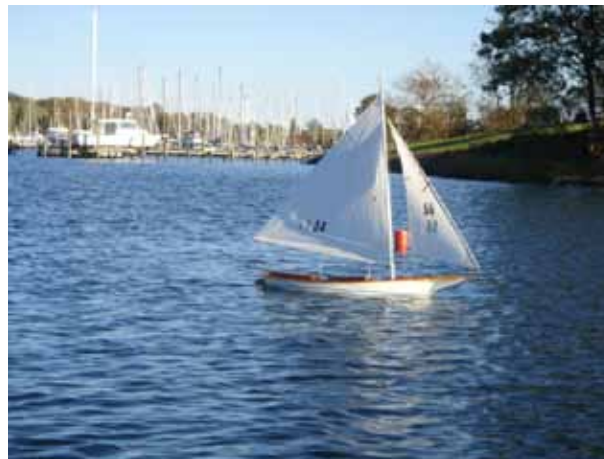
OR ENJOY A RELAXING SAIL