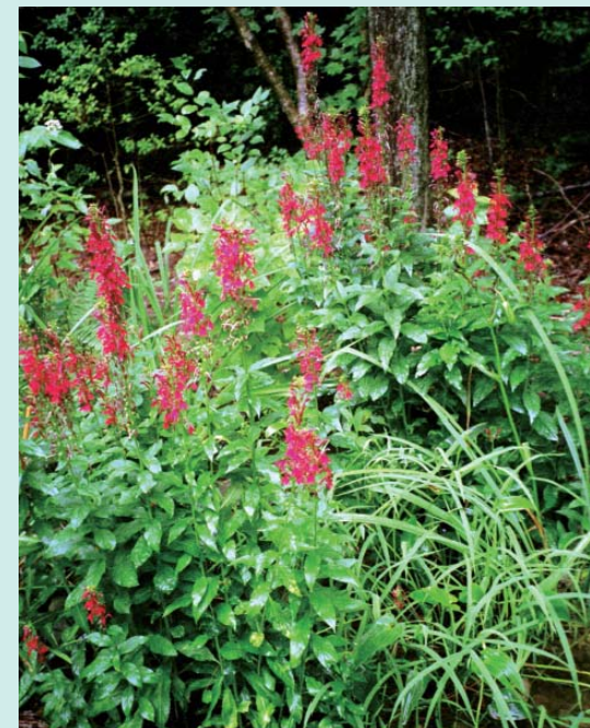
We Protect and Develop Healthy, Sustainable Forest Resources for Virginians